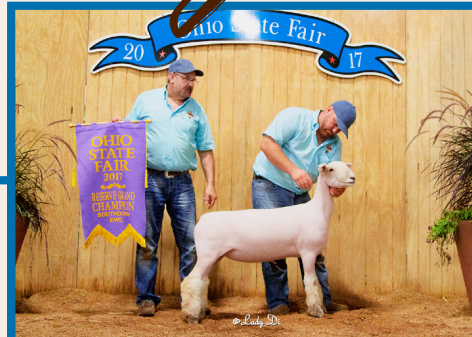
Reserve Champion Ewe 1st | March Ewe Lamb 2017 Ohio State Fair