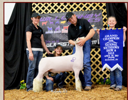
Grand Champion Ram National Southdown Show & Sale "SM Maddox 6201" Maddox 5022 "Elmo" x See N StaRRz Sold to McCalla Southdowns