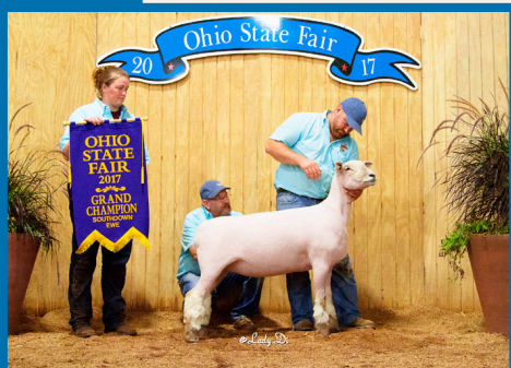
Grand Champion Ewe 1st | Class 1 Yearling Ewe 2017 Ohio State Fair