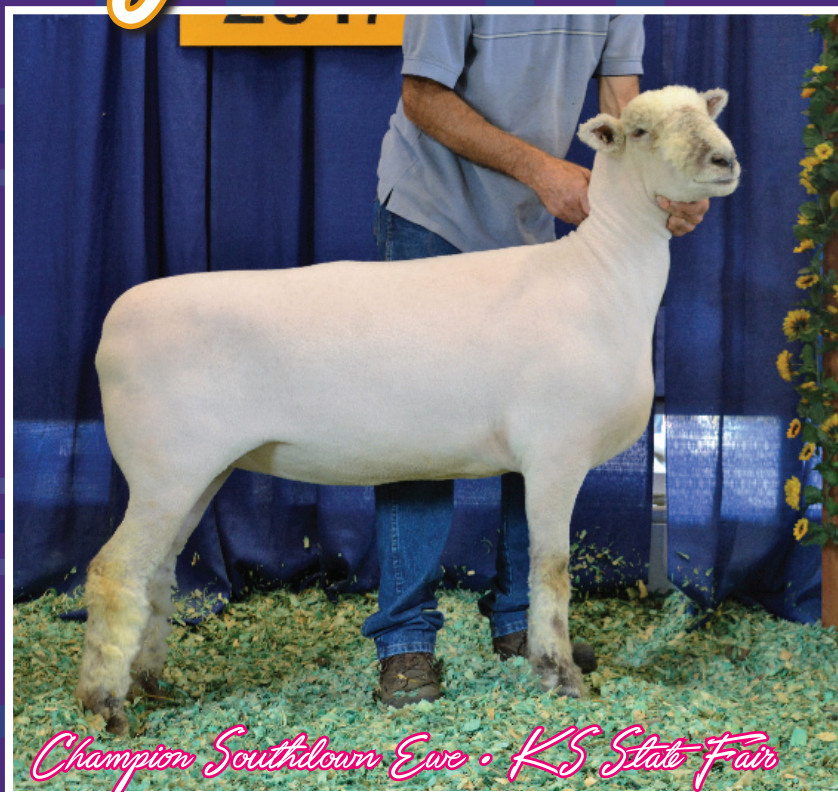
Champion Southdown Ewe • KS State Fair