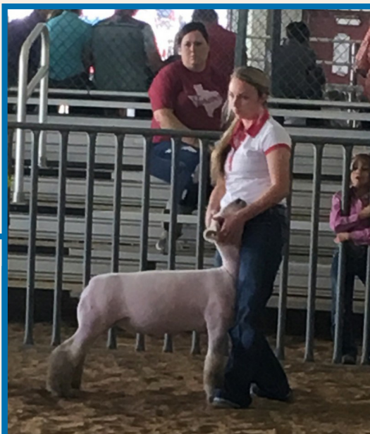
Popular Ewe Lamb on the Texas Circuit Sire: Riot Maker Dam: Old School Daughter