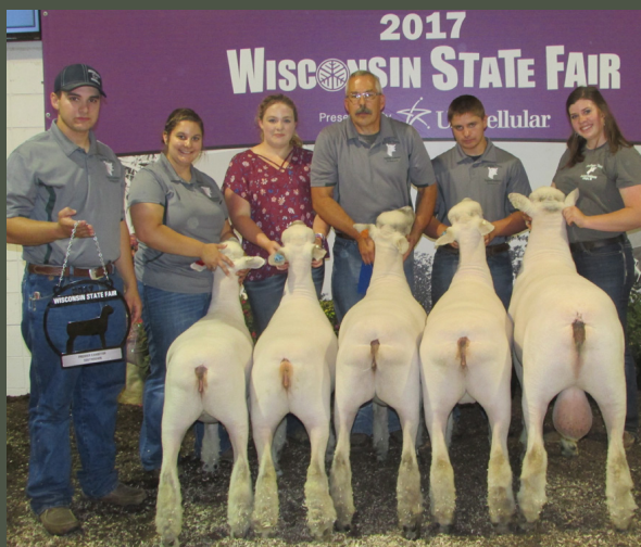
Wisconsin State Fair