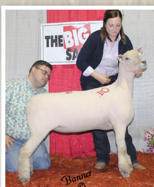
MB GENETICS 16F-1KE Res. Champion Ewe 2017 Big Ohio Sale Sire: Ace Prairieland Farms 5-A Dam: MB Genetics 1-95KE by Keystone Thank you University of Findlay!