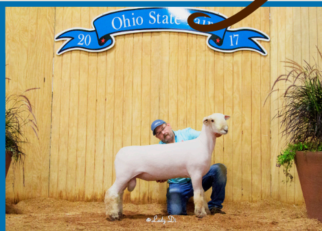
Reserve Champion Ram 1st | February Ram Lamb 2017 Ohio State Fair