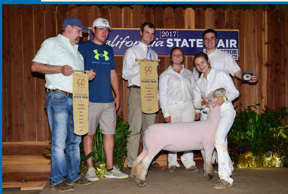
Supreme Ewe 2017 California State Fair Sire: Riot Maker