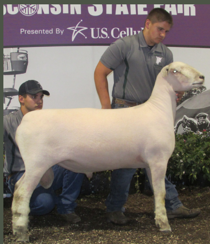
Introducing our new stud ram:

We would like to thank everyone who has added our genetics this past year and congratulate them on their success! Watch for our consignment to the Stars of Louisville Sale, updates on our website and Facebook page.