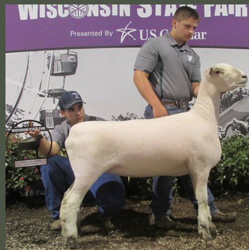
Res. Champion Ewe Wisconsin State Fair